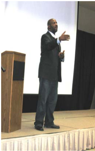
Dr. William Jelani Cobb

Three hundred and thirty-five students gathered to hear Dr. William Jelani Cobb, guest speaker for the Social Sciences Association's African Diaspora Dialogue program in November. The Dialogue is a forum designed for students and professors to talk about the importance of defining the African Diaspora, as well as the benefits and challenges of operating within its prevailing definitions. Dr. Cobb is an acclaimed author, historian and Chair of the History Department at Spelman College.