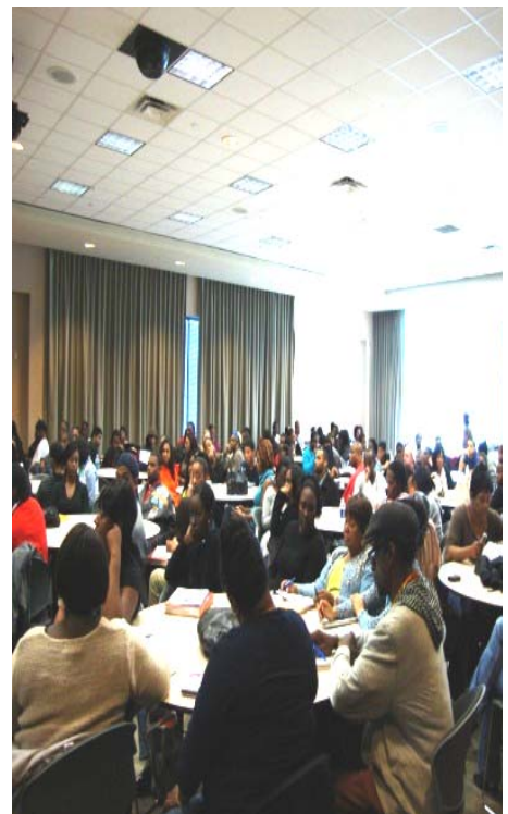
Students attend 2 nd African Diaspora