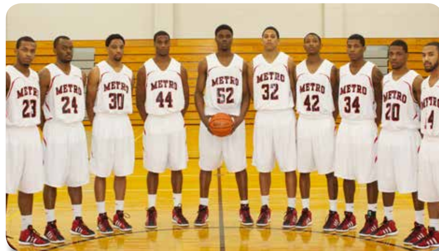
2011 - 2012 Mens Basketball Team