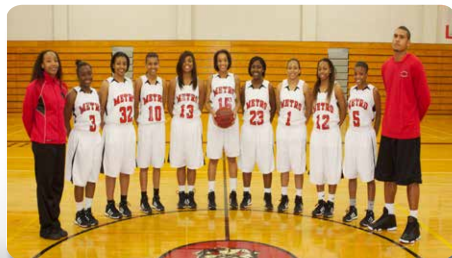
2011 - 2012 Womens Basketball Team