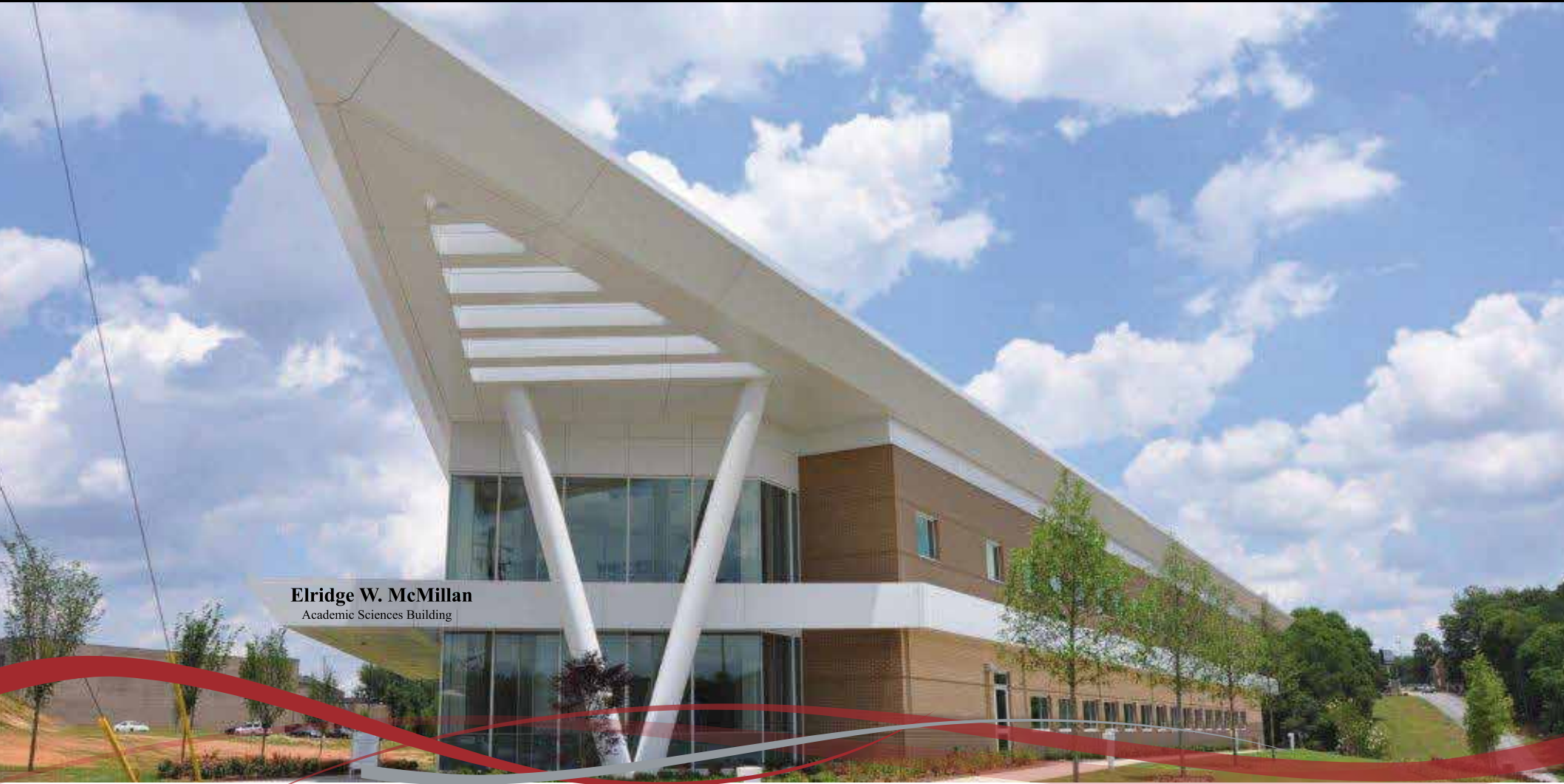
Elridge W. McMillan Academic Sciences Building