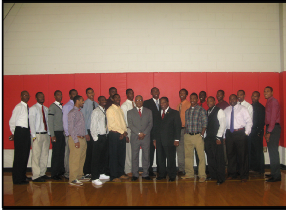
AMC 2010-2011 Basketball Team after receiving Conference Championship Rings