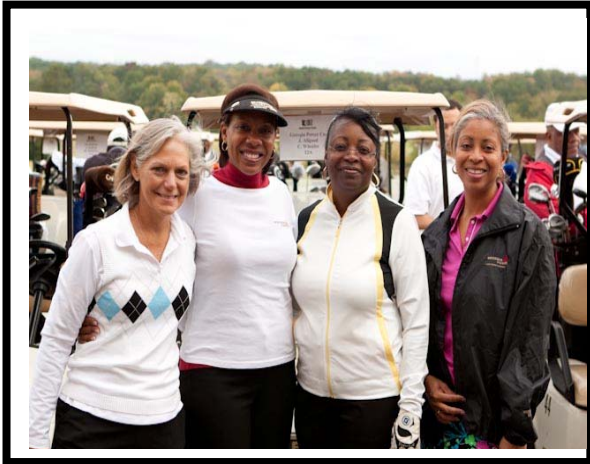
GA Power Golf Team