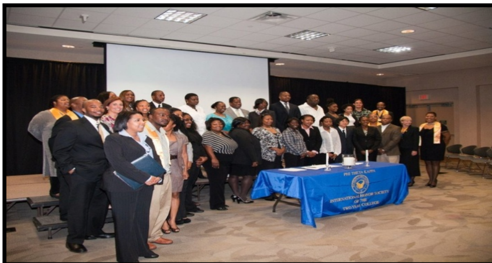
Phi Theta Kappa's Fall Induction Ceremony 2011