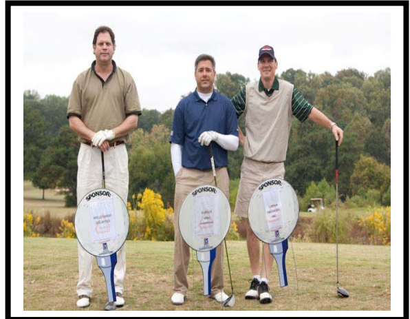
CBS Outdoor Golf Team