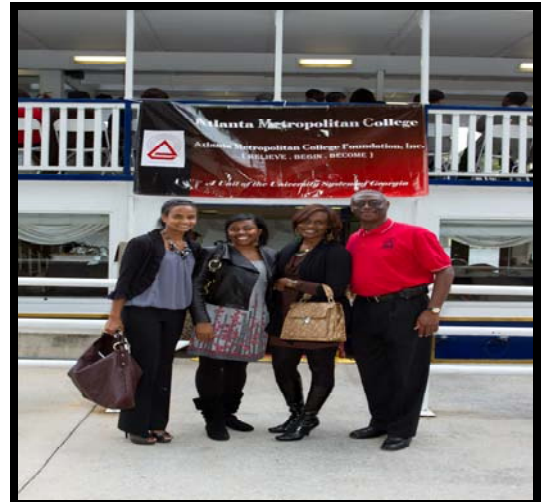
General Motors Partnership