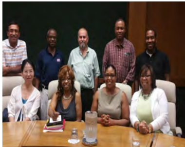
QEP Faculty Training 2015

QEP transformed three new classrooms/ labs in Science Lecture Building Spring 2016